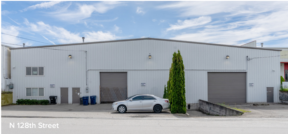
N 128th Street