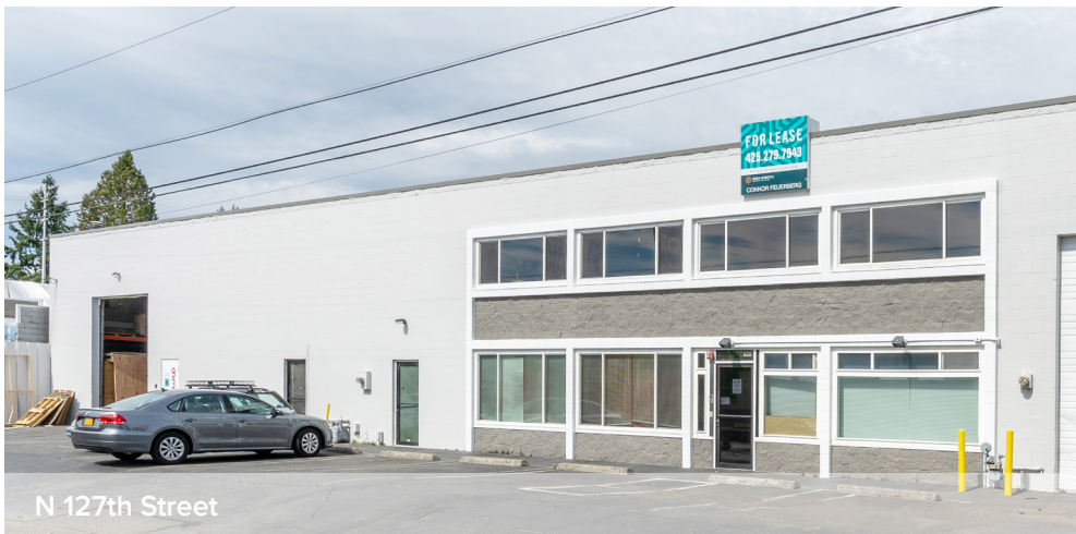
N 127th Street