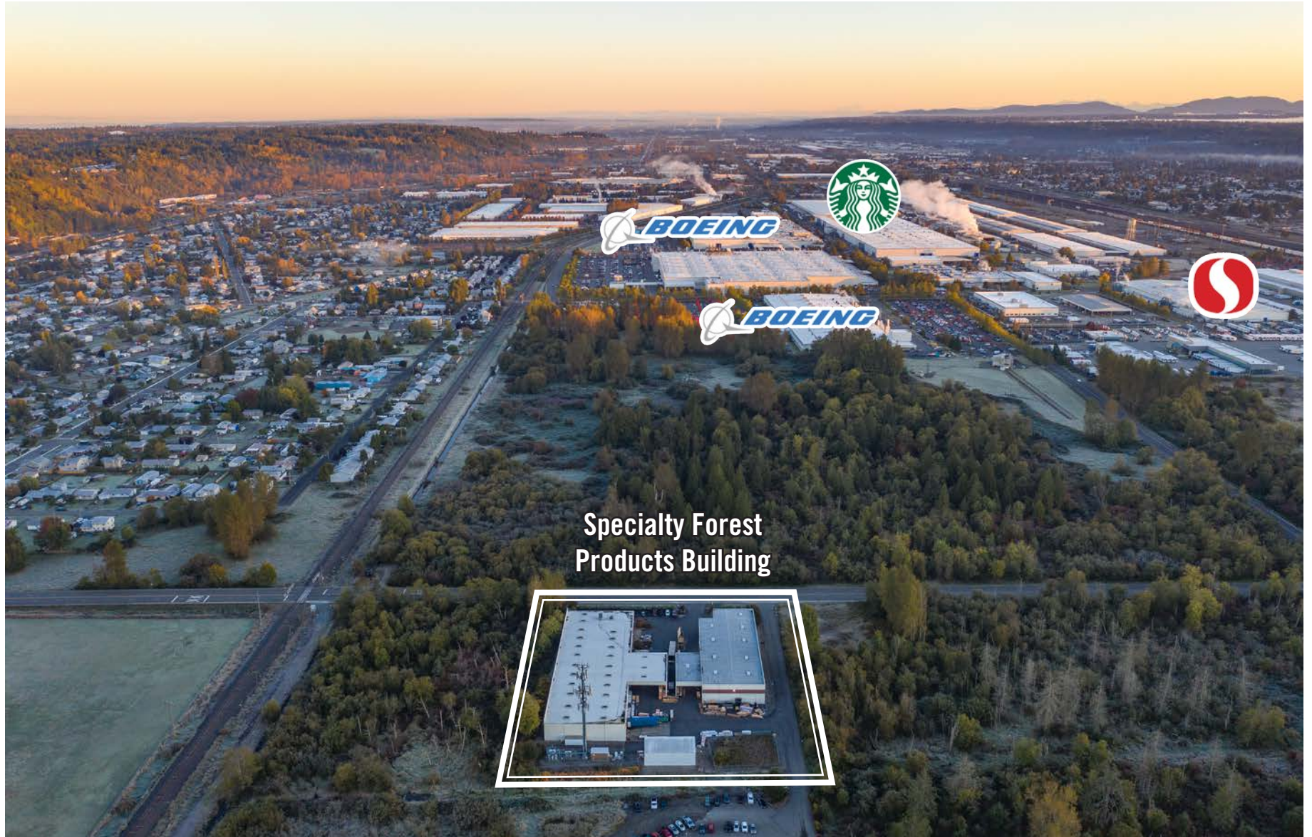
Specialty Forest Products Building