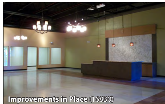
Improvements in Place (16830)

The information provided has been obtained from sources believed reliable. While we do not doubt its accuracy, we have not verified and make no guarantee, warranty or representation about it. It is your sole responsibility to independently confirm its accuracy and completeness.