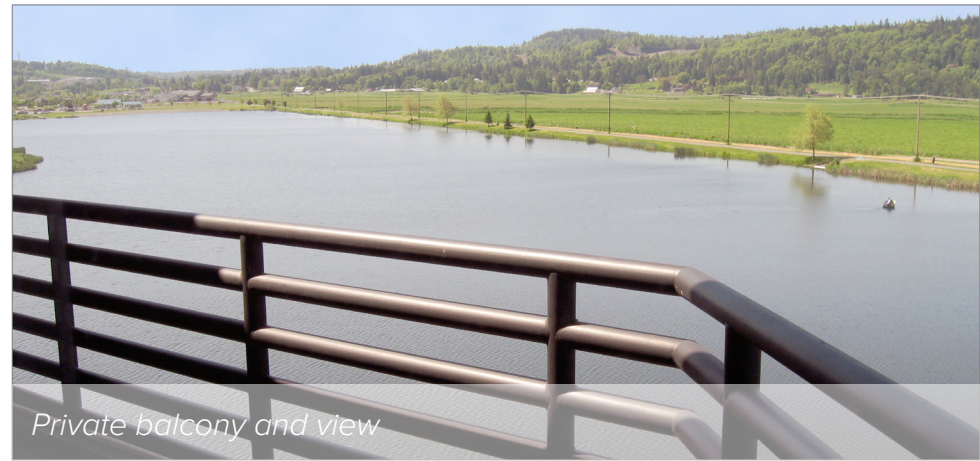
Private balcony and view