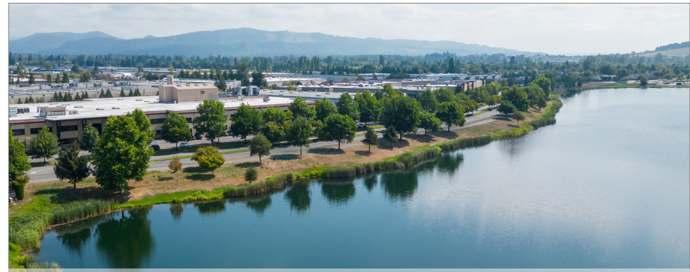
Lake Tye & Lake Tye Trail