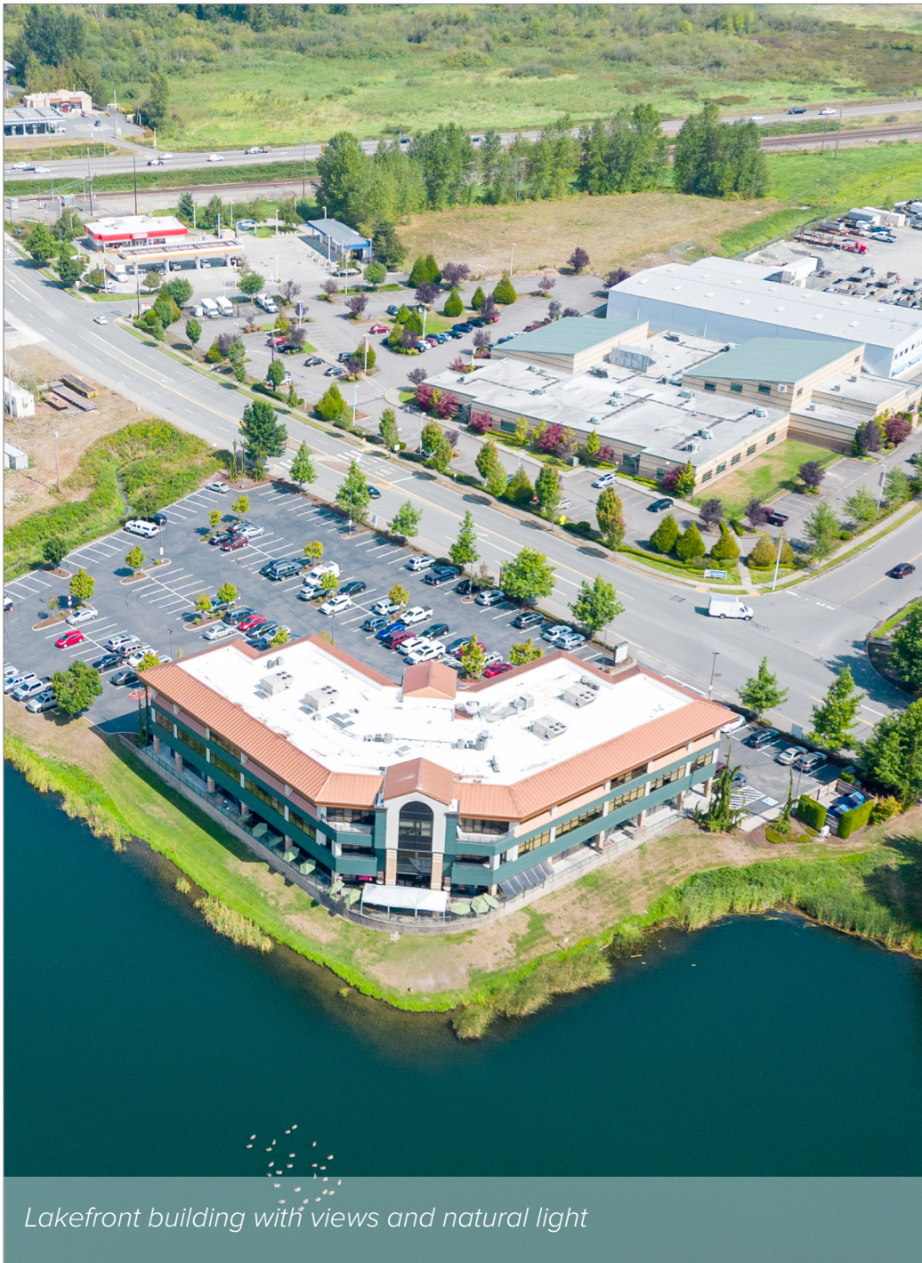
Lakefront building with views and natural light