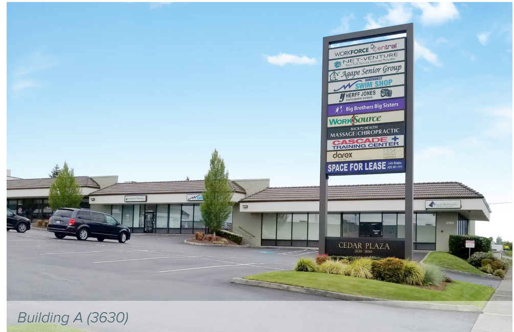
Building A (3630)

The information provided herein has been obtained from sources believed to be reliable, but no representation or warranty, express or implied, is made with respect to the accuracy or completeness of any such information. Each prospective buyer or tenant should independently investigate, evaluate and verify all information provided herein and any other matters deemed material. Please consult your attorney, tax advisor or other professional advisor. The terms of sale or lease set forth herein are subject to change or withdrawal at any time and without notice.