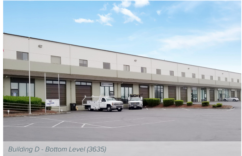
Building D - Bottom Level (3635)