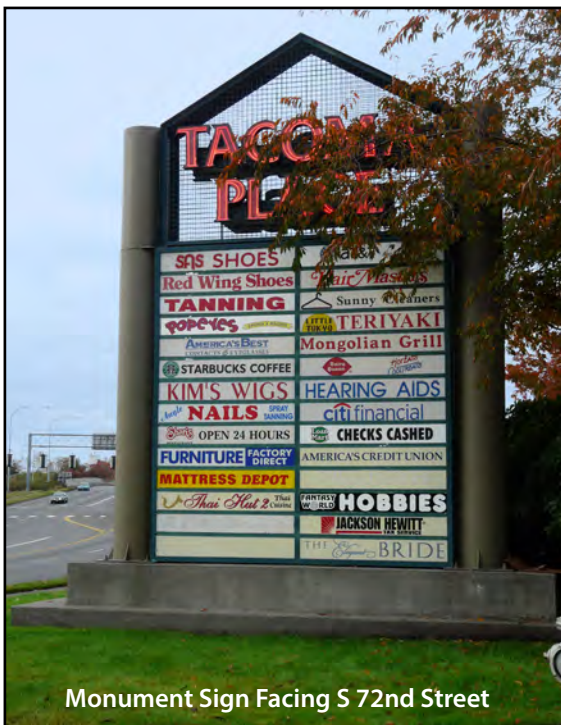
Monument Sign Facing S 72nd Street