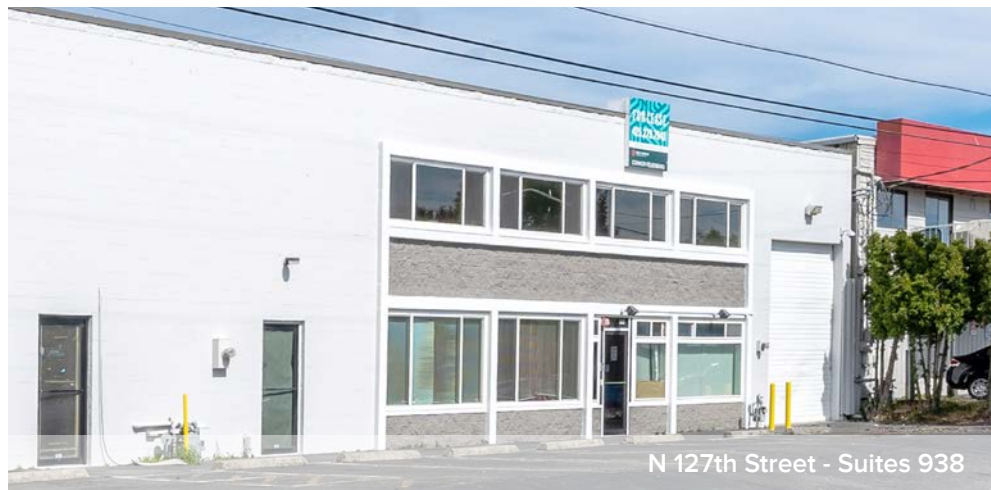
N 127th Street - Suites 938