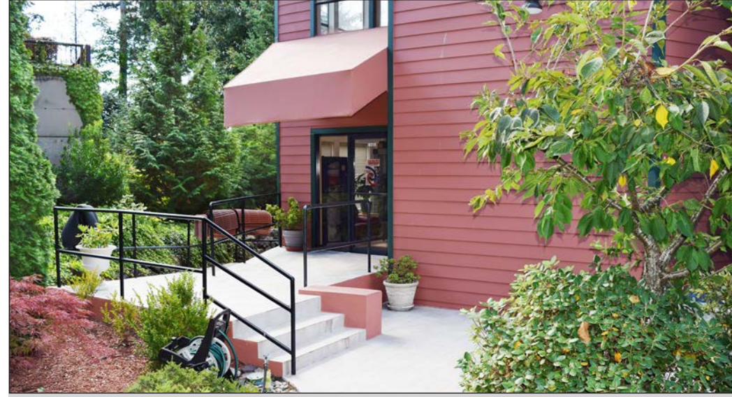
Pride of Ownership