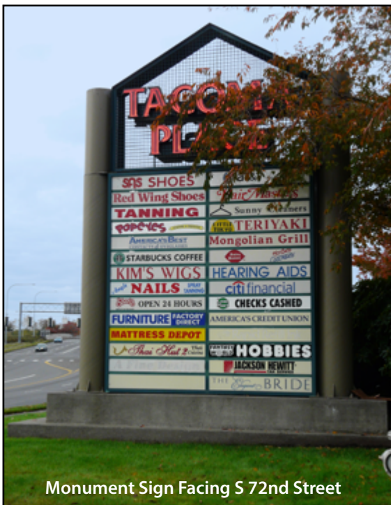
Monument Sign Facing S 72nd Street