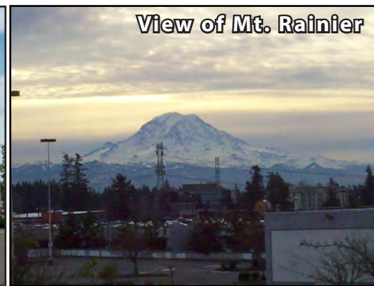
View of Mt. Rainier

Rosen~Harbottle Commercial Real Estate | P.O. Box 5003 Bellevue, WA 98009-5003 phone: (425) 454-3030 fax: (425) 454-6705 | www.rosenharbottle.com