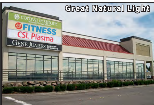
Great Natural Light