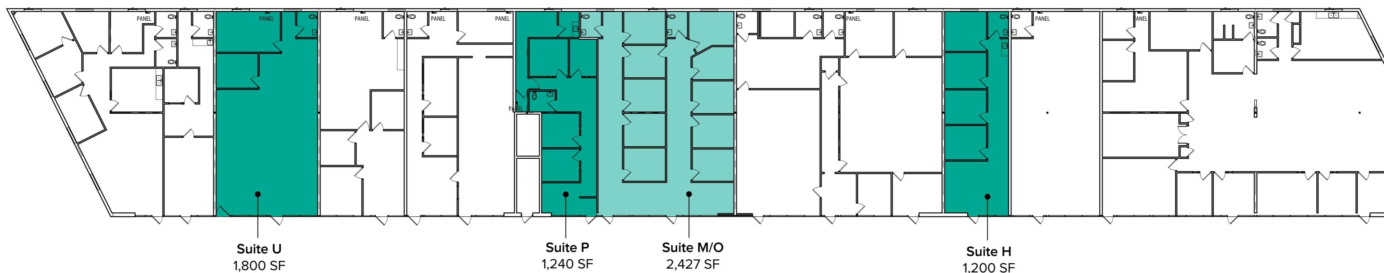
10A UPPER FLOOR PLAN - 3640 S Cedar Street 1/16" = 1'-0"