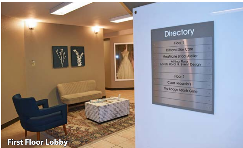
First Floor Lobby