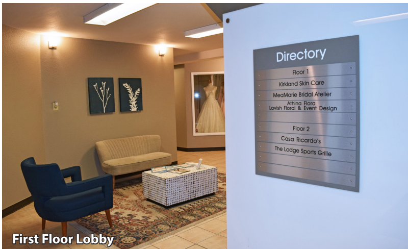
First Floor Lobby