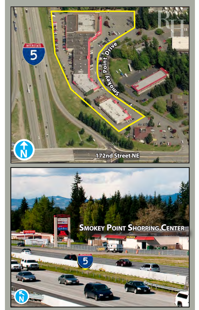
Extensive I-5 Visibility & Frontage