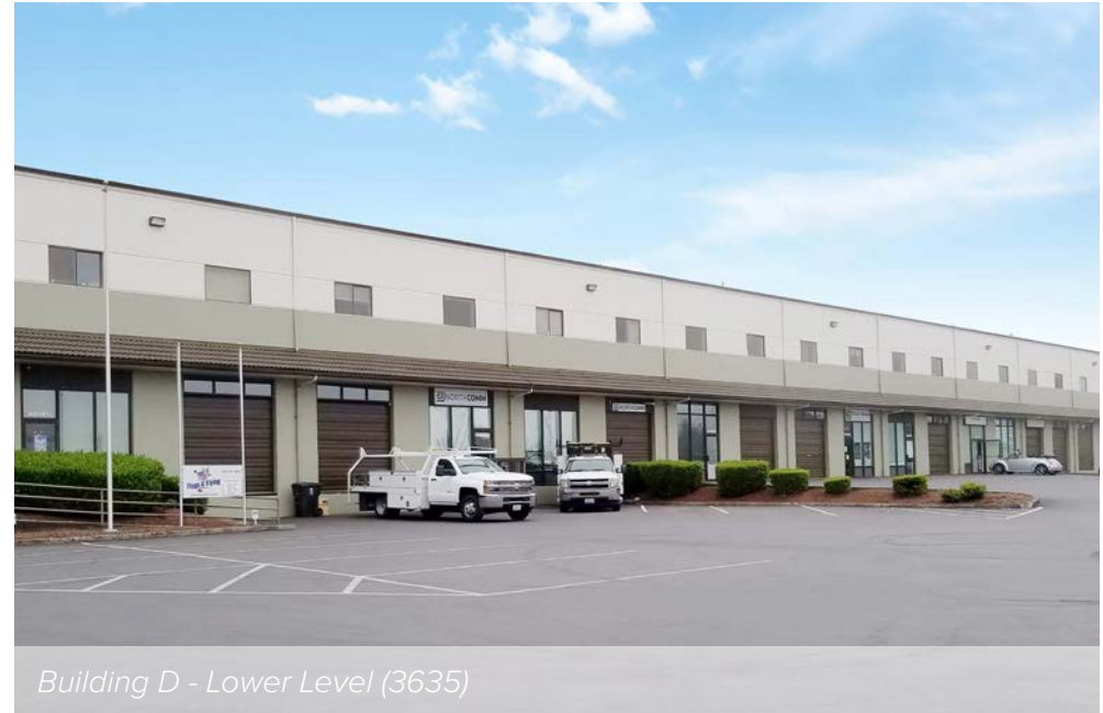
Building D - Lower Level (3635)