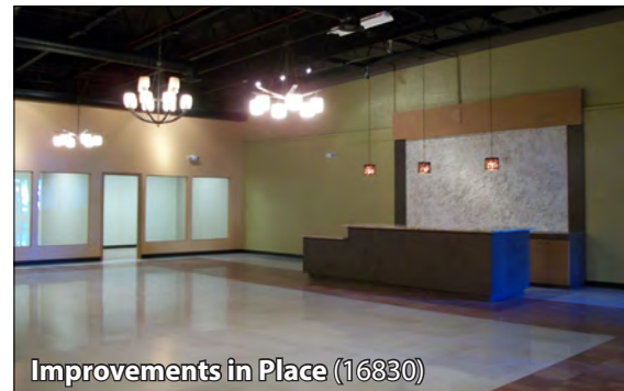
Improvements in Place (16830)

The information provided has been obtained from sources believed reliable. While we do not doubt its accuracy, we have not verified and make no guarantee, warranty or representation about it. It is your sole responsibility to independently confirm its accuracy and completeness.