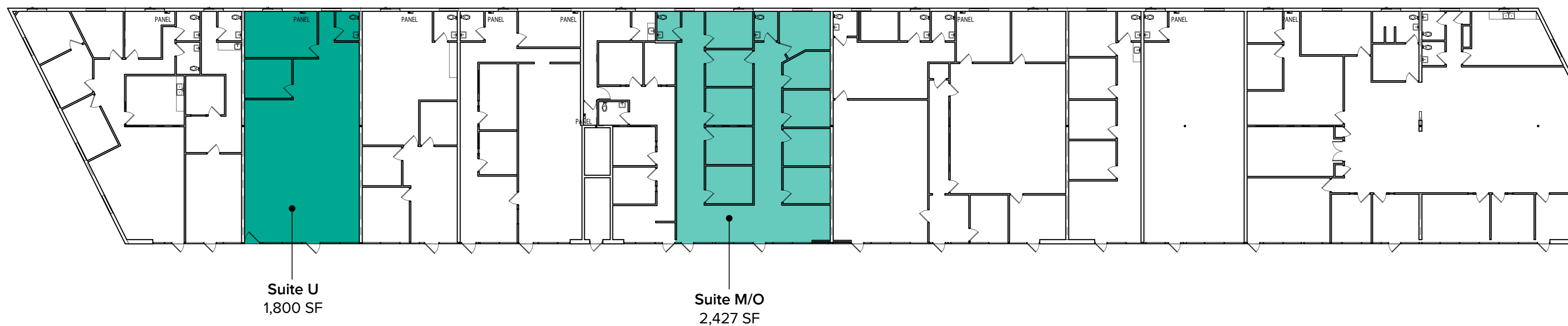
10A UPPER FLOOR PLAN - 3640 S Cedar Street 1/16" = 1'-0"