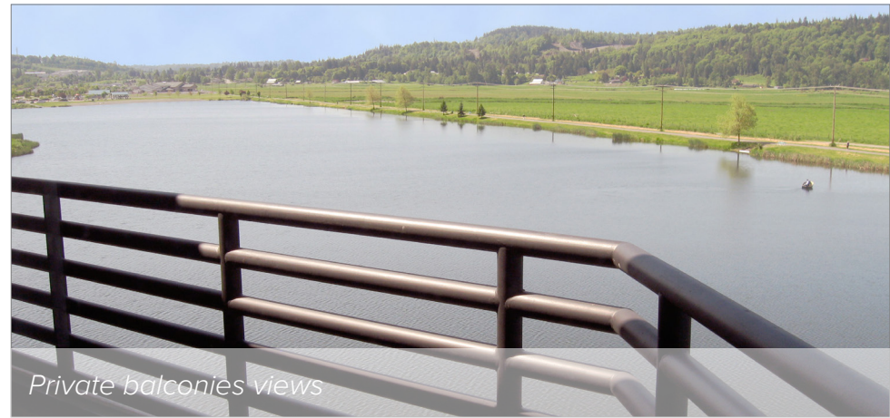
Private balconies views