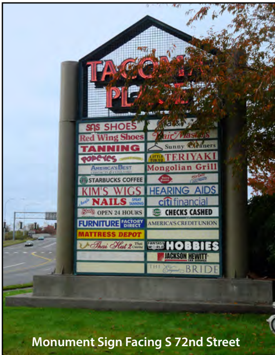
Monument Sign Facing S 72nd Street