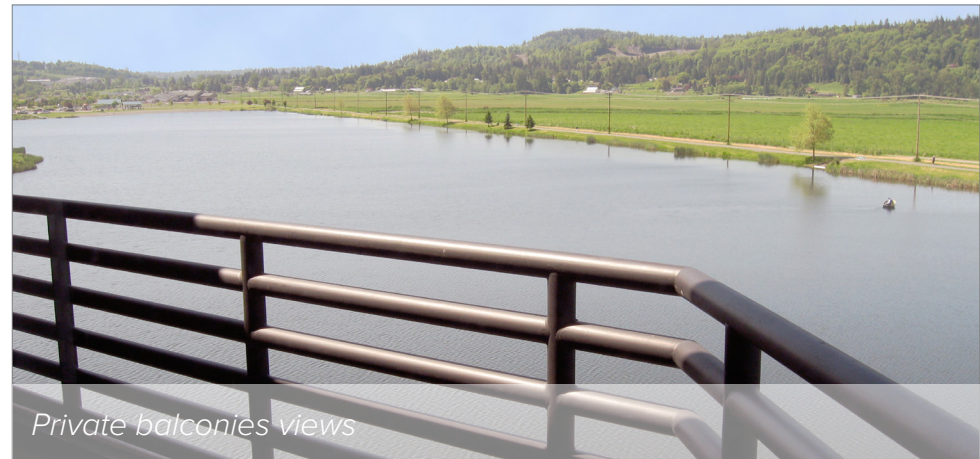
Private balconies views