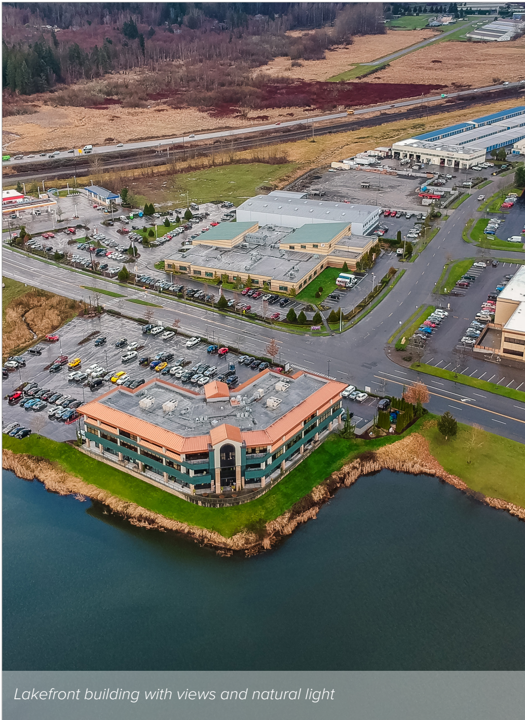
Lakefront building with views and natural light