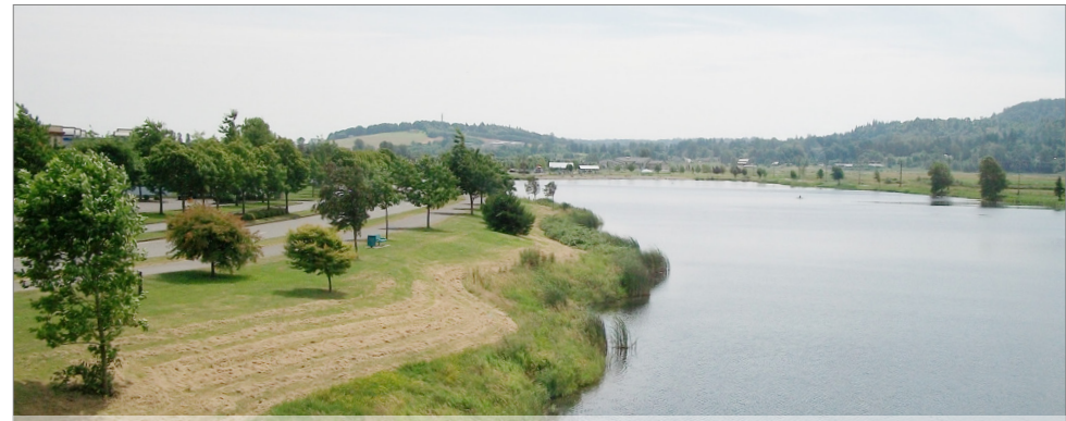
Lake Tye & Lake Tye Trail