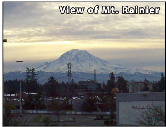
View of Mt. Rainier

Rosen~Harbottle Commercial Real Estate | P.O. Box 5003 Bellevue, WA 98009-5003 phone: (425) 454-3030 fax: (425) 454-6705 | www.rosenharbottle.com