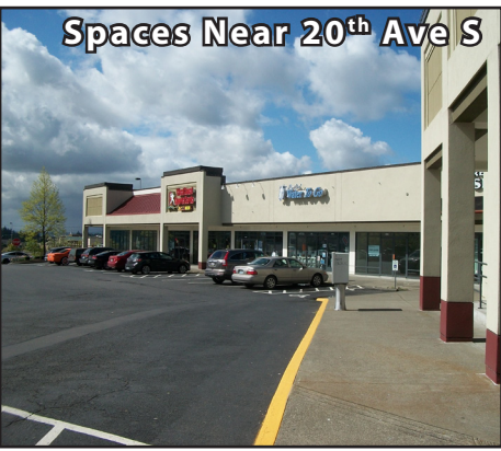
Spaces Near 20 th Ave S