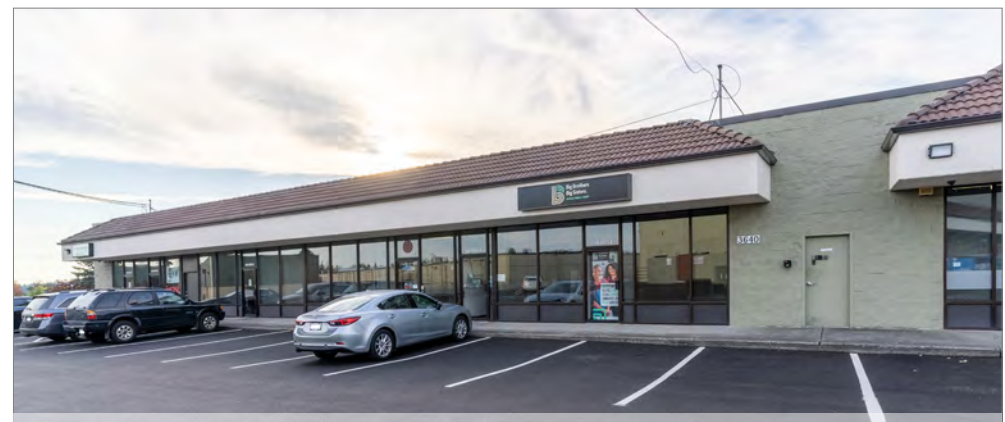
Building D - Top Level (3640)

The information provided herein has been obtained from sources believed to be reliable, but no representation or warranty, express or implied, is made with respect to the accuracy or completeness of any such information. Each prospective buyer or tenant should independently investigate, evaluate and verify all information provided herein and any other matters deemed material. Please consult your attorney, tax advisor or other professional advisor. The terms of sale or lease set forth herein are subject to change or withdrawal at any time and without notice.