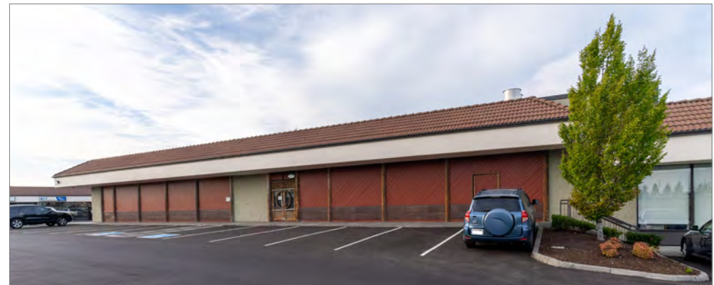
Building B (3680)