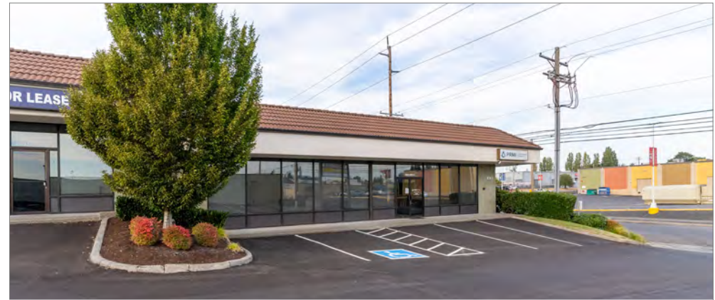
Building A (3630)