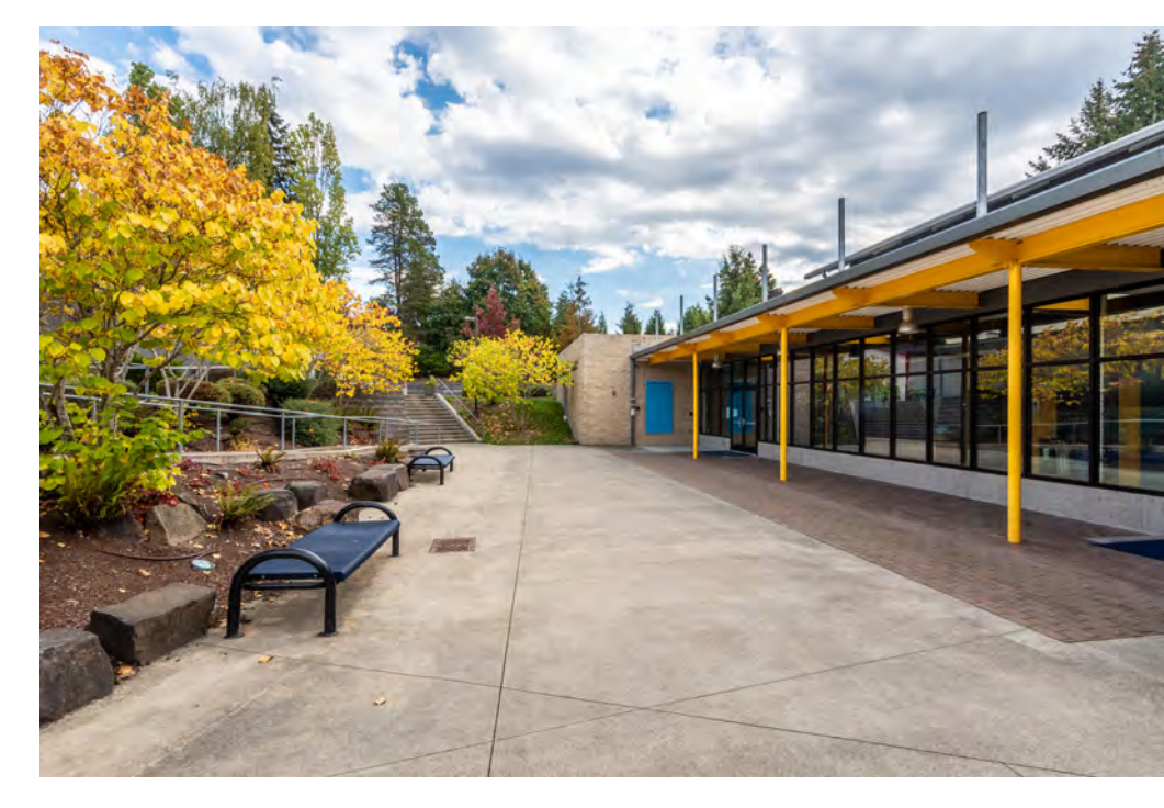
The information provided has been obtained from sources believed reliable. While we do not doubt its accuracy, we have not verified and make no guarantee, warranty or representation about it. It is your sole responsibility to independently confirm its accuracy and completeness.