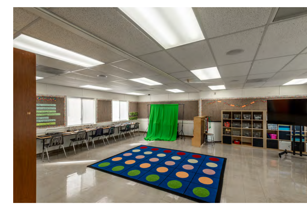
The information provided has been obtained from sources believed reliable. While we do not doubt its accuracy, we have not verified and make no guarantee, warranty or representation about it. It is your sole responsibility to independently confirm its accuracy and completeness.