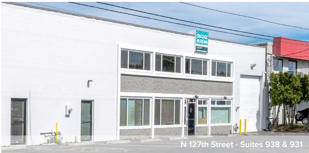
N 127th Street - Suites 938 & 931