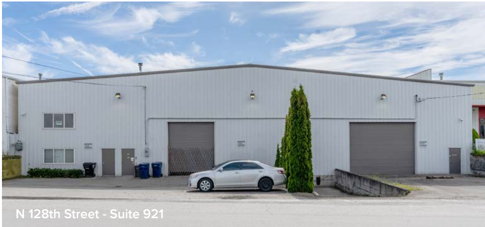
N 128th Street - Suite 921