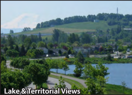
Lake & Territorial Views

14090 Fryelands Boulevard, Monroe, WA 98272