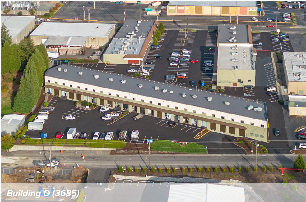
Building D (3635)