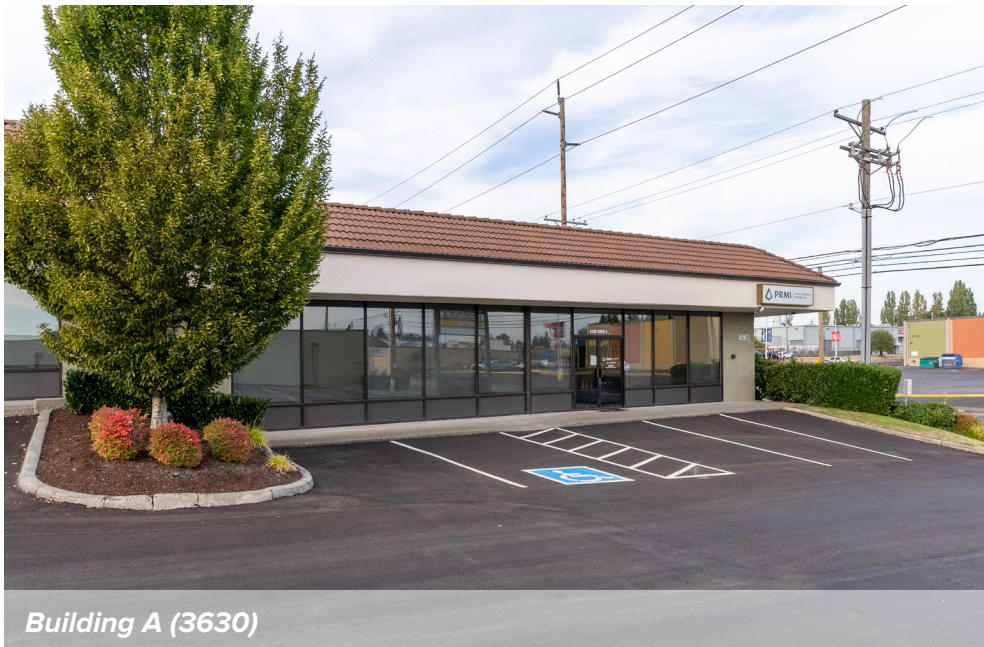
Building A (3630)

The information provided herein has been obtained from sources believed to be reliable, but no representation or warranty, express or implied, is made with respect to the accuracy or completeness of any such information. Each prospective buyer or tenant should independently investigate, evaluate and verify all information provided herein and any other matters deemed material. Please consult your attorney, tax advisor or other professional advisor. The terms of sale or lease set forth herein are subject to change or withdrawal at any time and without notice.