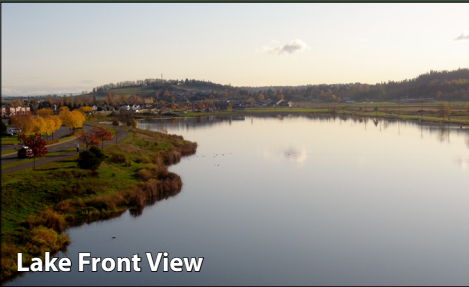
Lake Front View

14090 Fryelands Boulevard, Monroe, WA 98272