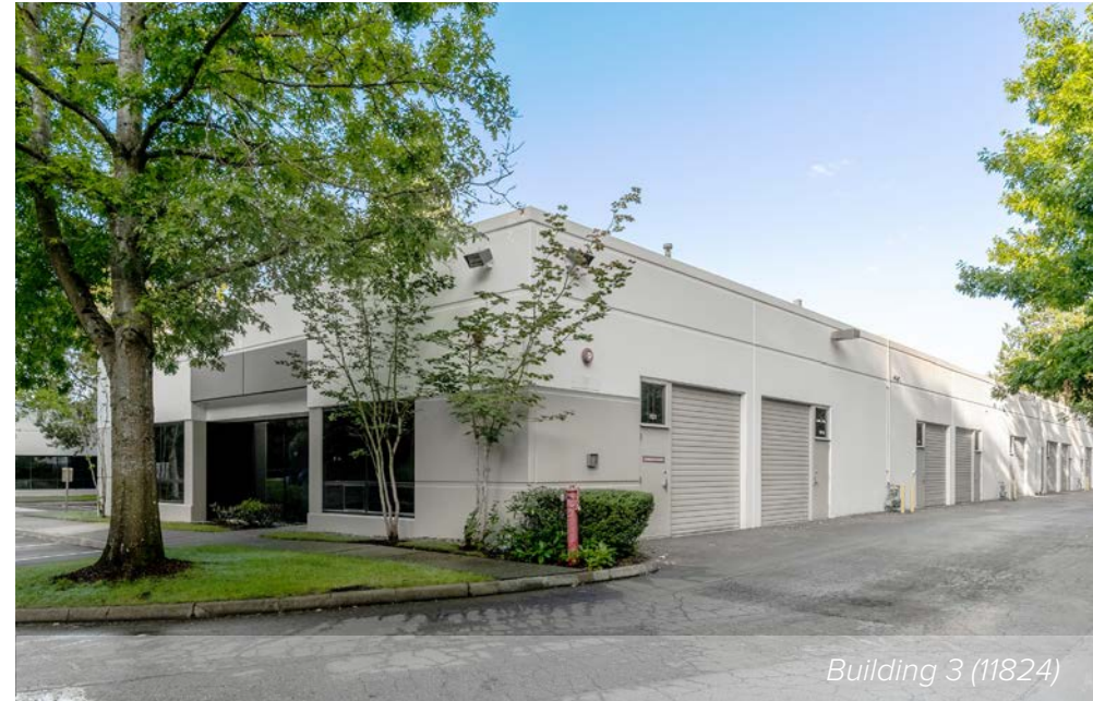
Building 3 (11824)