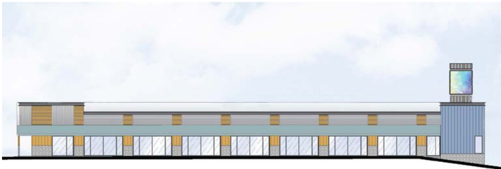
New South Elevation Renovations