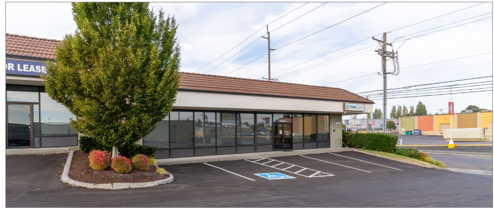
Building A (3630)