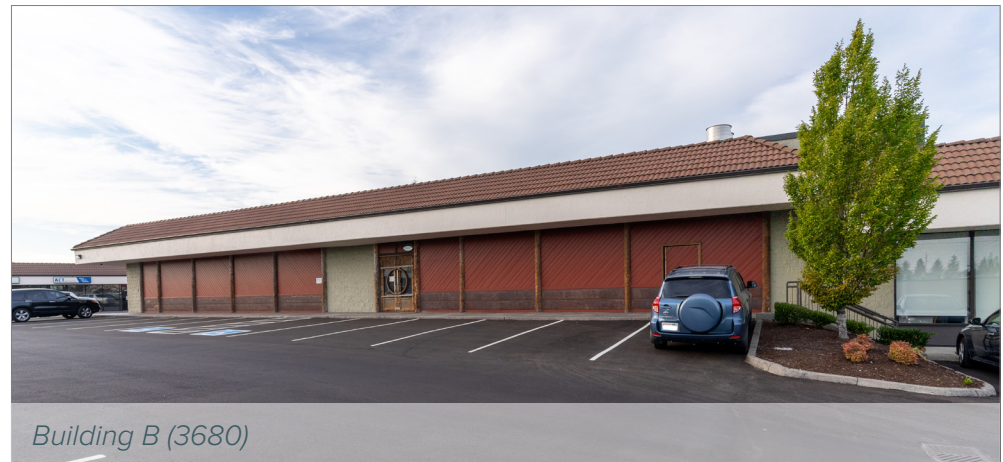
Building B (3680)