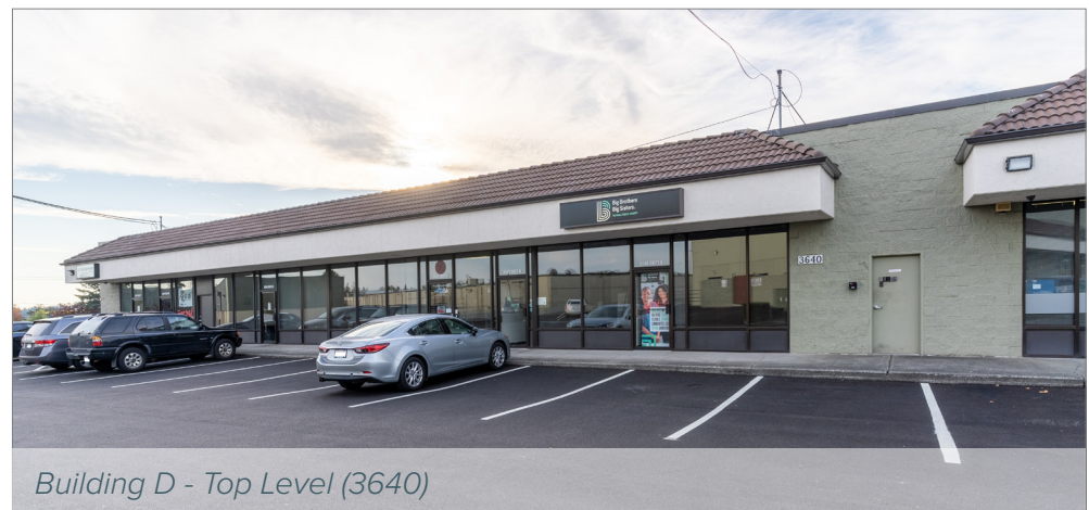
Building D - Top Level (3640)

The information provided herein has been obtained from sources believed to be reliable, but no representation or warranty, express or implied, is made with respect to the accuracy or completeness of any such information. Each prospective buyer or tenant should independently investigate, evaluate and verify all information provided herein and any other matters deemed material. Please consult your attorney, tax advisor or other professional advisor. The terms of sale or lease set forth herein are subject to change or withdrawal at any time and without notice.